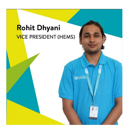
My campaigns, policy and other work