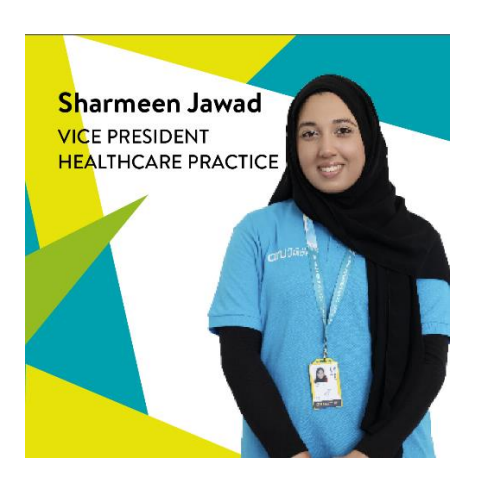
My campaigns, policy and other work