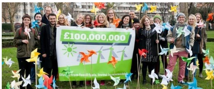
Launch of Divest/Invest campaign at SOAS, the first London based institution to divest. Jan 2016

In 2015/16 the Green Impact campaign worked in partnership with students' unions and over 179 organisations including, community organisations, NHS Trusts, local councils, and fire brigades. The partnership consisted of over 1,075 organisational teams encompassing 19,916 staff, approximately 3,202 of whom sat on local Green Impact teams. To date the scheme has delivered 256,491 actions, 46,743 as a direct result of the scheme, and this year we have trained over 500 students as volunteer auditors or in supporting teams throughout the programme as a project assistant.