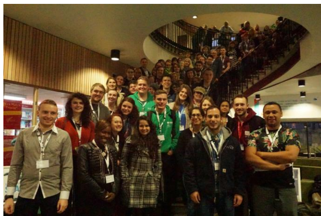
Delegates of the NUS' 2nd Student Sustainability Summit, University of Bristol Students' Union, November 2015